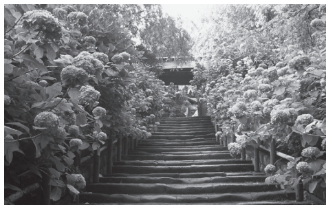
(Hydrangea in June)