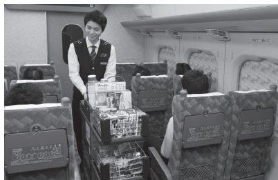
CENTRAL PASSENGERS