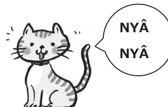
The sound of a cat meowing