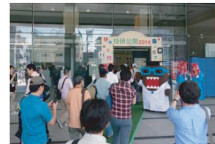
The STRL Open House is held every year in May to introduce our R&D to the public.