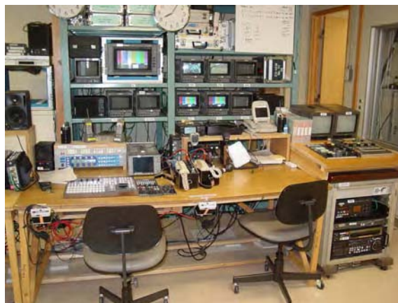
Fig.3 Control room in the Antarctic HDTV station

the horizon. Intelsat 904 (IOR60E) is used for live broadcasting.