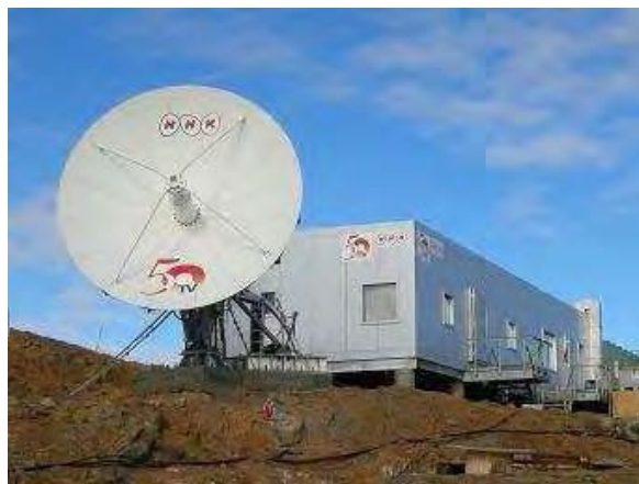
Fig.1 Antarctic HDTV broadcasting station

To mark the 50th anniversary of television broadcasting in Japan, we considered what NHK as a broadcaster could do for society, and decided upon images of Antarctica. This vast continent, the last unexplored region of the world, and its untouched nature, might provide clues to solving today's global environmental threats. The HDTV Broadcasting Station in Antarctica involved the basics of broadcasting—to capture images never seen before and broadcast them live. The sun that never sets, howling blizzards, dancing auroras in the sky, the first complete solar eclipse seen from Antarctica—