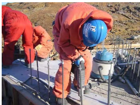
Fig.2 Construction of the 4.8m parabolic antenna

started strenuous training for the construction of the broadcasting station by snatching whatever time we could as preparations continued. In November 2002, we set sail for the white continent aboard the Shirase Antarctic observation vessel, loaded with 60 tons of equipment. About three weeks later the crew arrived at Syowa Station where we immediately started setting up antennas, cameras, VCRs and other equipment for live broadcasting, ironing out technical glitches along the way (Fig.2). On January 28, 2003, an HDTV circuit to Japan was established, only three days before the start of live broadcasting. Finally, on February 1, on the 50th anniversary of television broadcasting in Japan, the crew began telecasting the world's first HDTV images of glaciers live from Antarctica for the home audience.