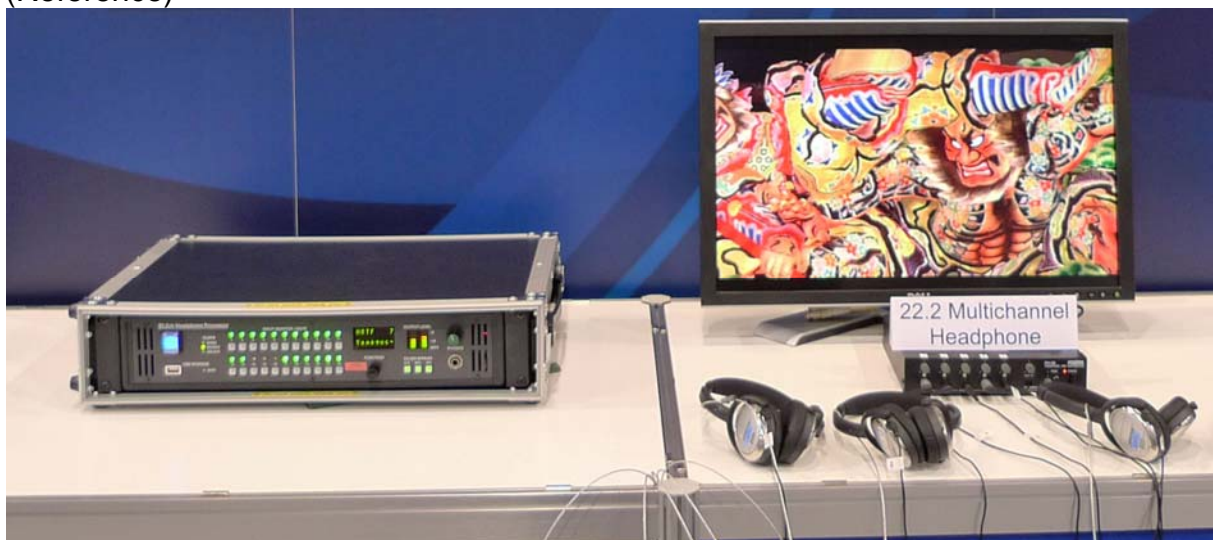
Newly developed 22.2 multichannel headphone processor