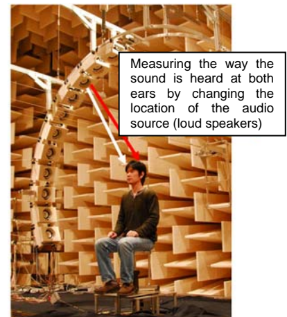
Measurement for inducing head-related transfer function

Humans perceive sound direction using both ears. The factors for judging sound direction include differences in the strength and time lag of the sounds reaching the right and left ears as well as variations in tonal quality due to individual differences in the shape of the head or ears. The function that mathematically expresses these factors is called the "head-related transfer function (HRTF)." The newly developed processor uses the values measured in advance.