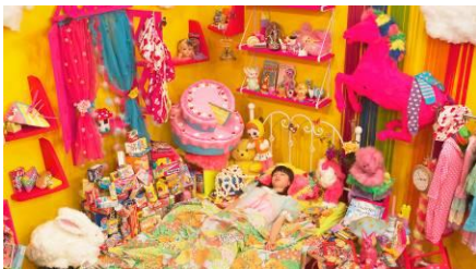
Kawaii International (Chinese title: 卡哇伊无国界)

A guide to Japanese kawaii culture. Join our panel of fashion and pop-culture experts as they delve into the past, present, and future of this global phenomenon.