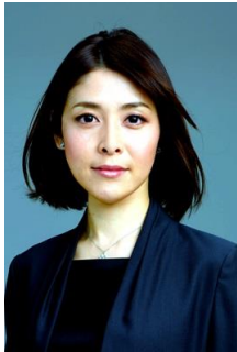
Chiaki Kamakura (鎌倉千秋) NHK announcer appearing in NHK's current affairs program 'Today's Close-up Plus'