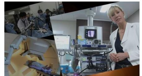
Medical Frontiers (Chinese title: 医疗前沿)

An in-depth portrait of Asia today, covering its dynamism as a center of growth as well as its traditions tossed around by the advance of globalization.