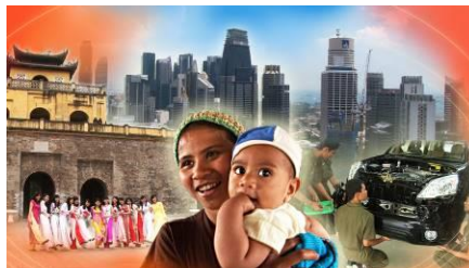
Asia Insight (Chinese title: 亚洲视角)

A guide to Japanese kawaii culture. Join our panel of fashion and pop-culture experts as they delve into the past, present, and future of this global phenomenon.